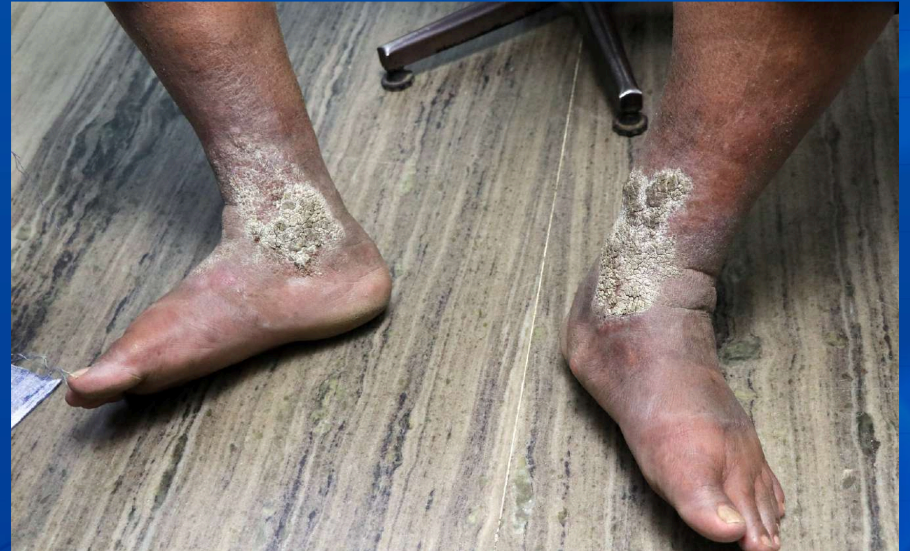
Extensive variety of cases are seen & discussed (160+ cases seen in 10 days). Perhaps the ONLY programme in the world, which demonstrate 125+ LIVE non-edited cases in 10 days, where live interaction with patient is encouraged.