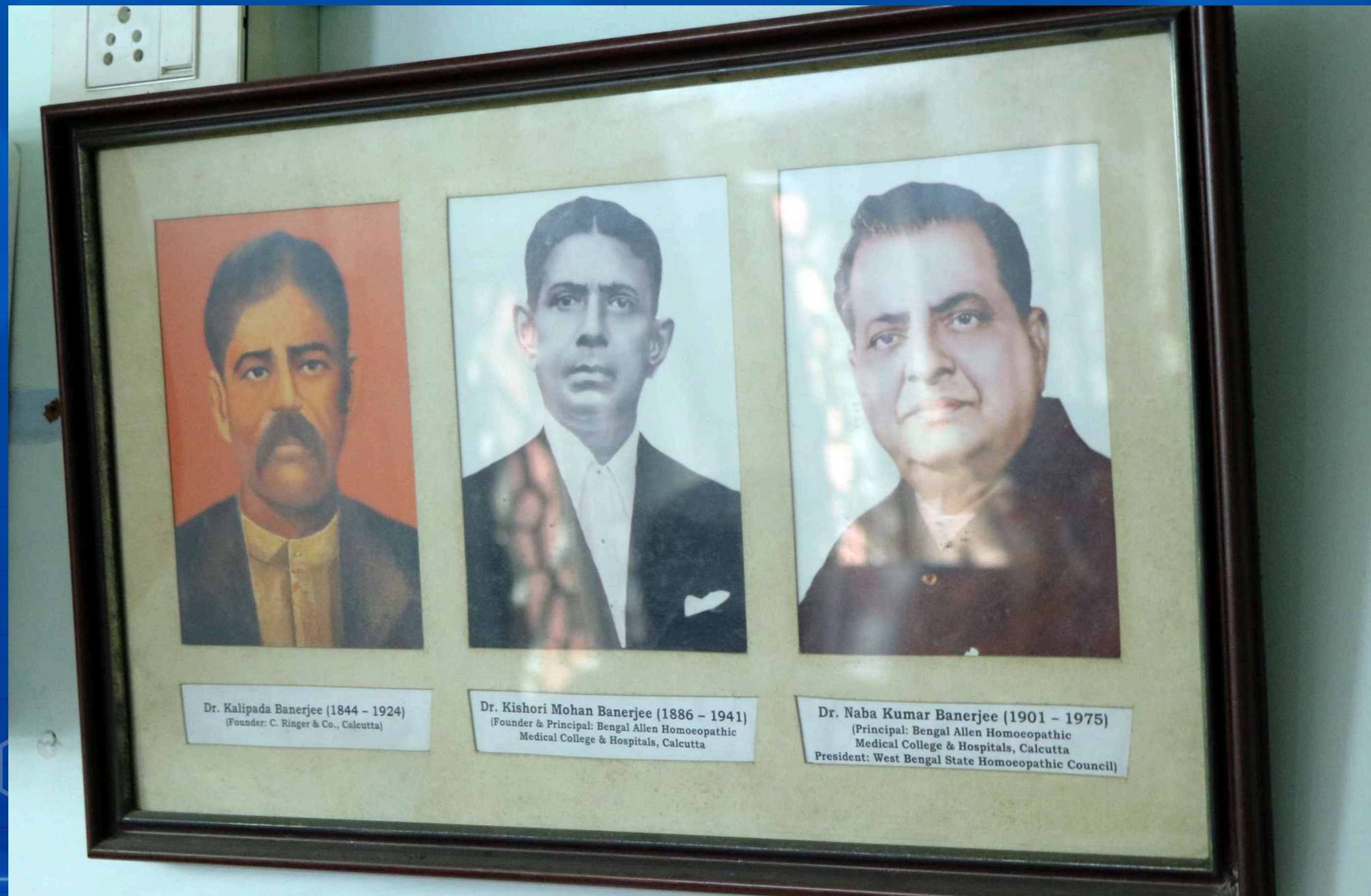
Picture of three generations of Classical homoeopaths of Banerjee's family.