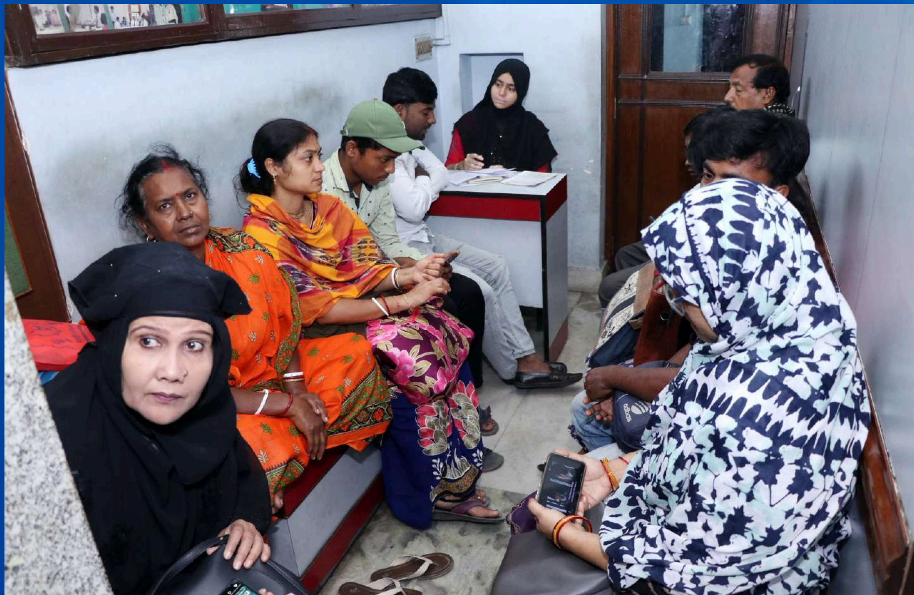
Patients are waiting to be seen.