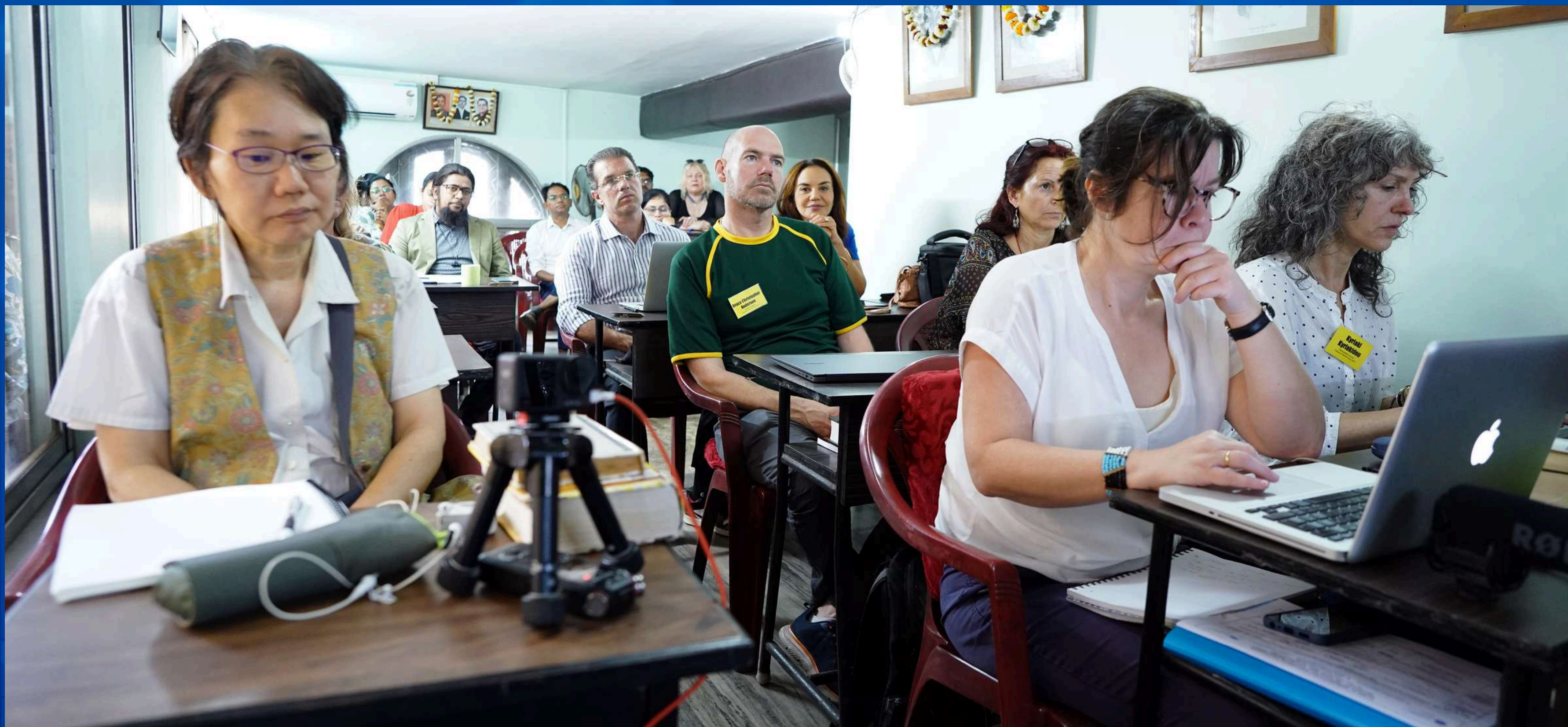
Calcutta Clinical Programme 2025.