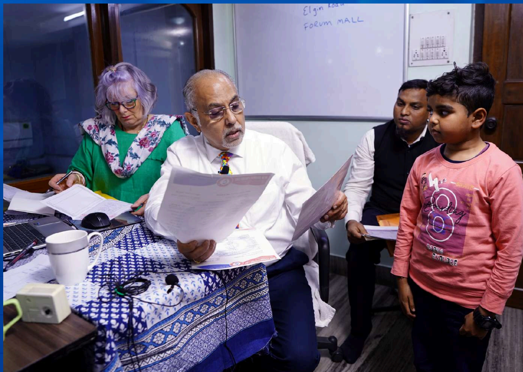
Live case demonstration with interpretation of medical reports before and after homoeopathic treatment, Calcutta Clinical Programme 2025.