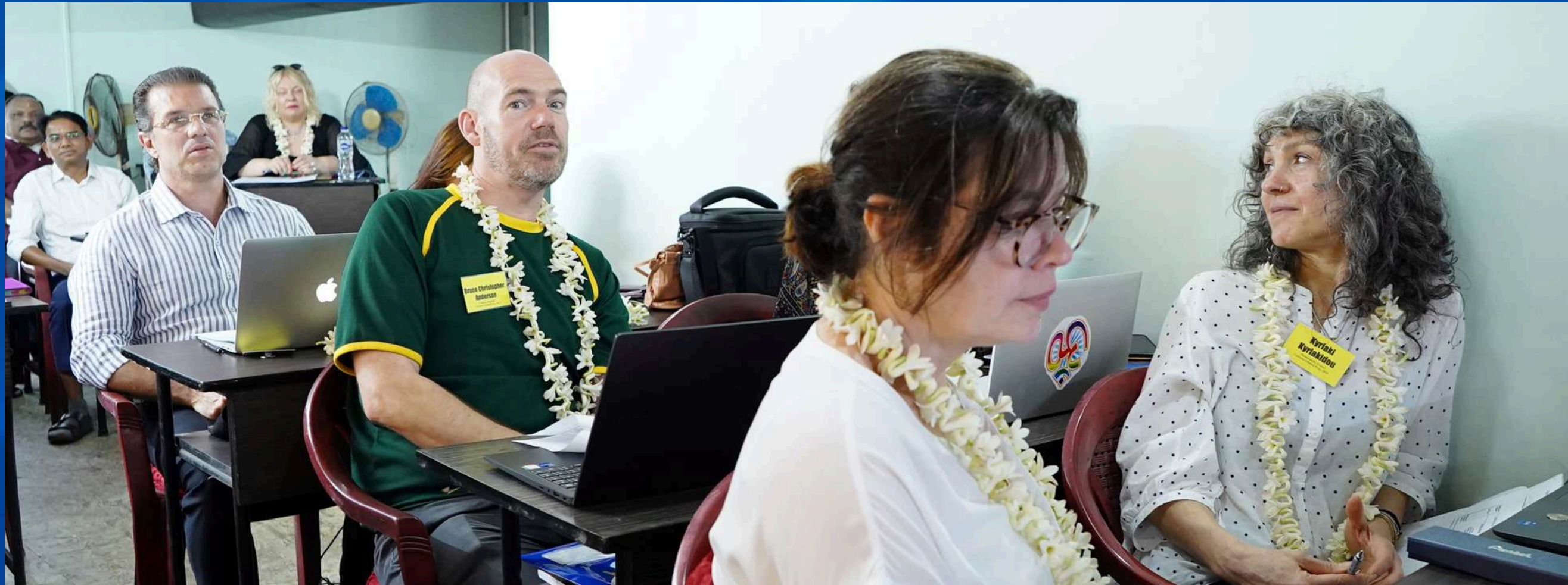
Participants of Calcutta Clinical Programme 2025.

Rapid prescribing in the Slum Clinic; 40 cases were seen in 3 hours!