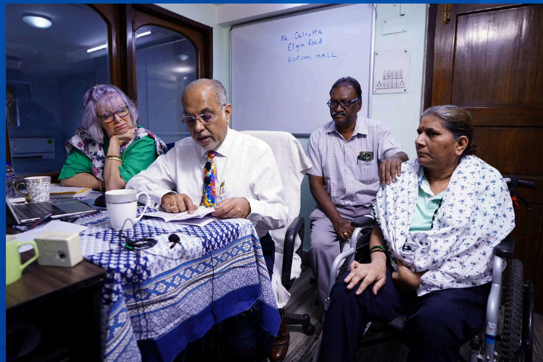
Patient in wheel chair: Numbness & Neuralgia after Car Accident, improving after Bellis Perennis 50,000: The Classical Kentian Homoeopathy!